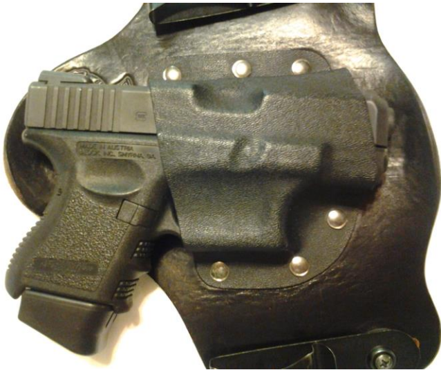
Glock 26 in the holster

Above you can see more of how the holster has molded around my body.