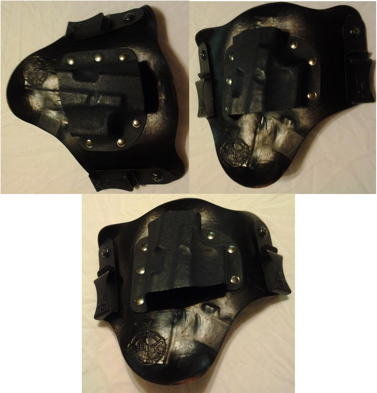
Here you can see some of the shaping and indentions from the Glocks I have worn.

In February I purchased a Goldstar IWB holster and work it off and on through Halloween (it will be the subject of my next review). Knowing I was wanting to write a positive review I began wearing the CrossBreed again for the entire month of November 2013 just to be sure I was on top of things.