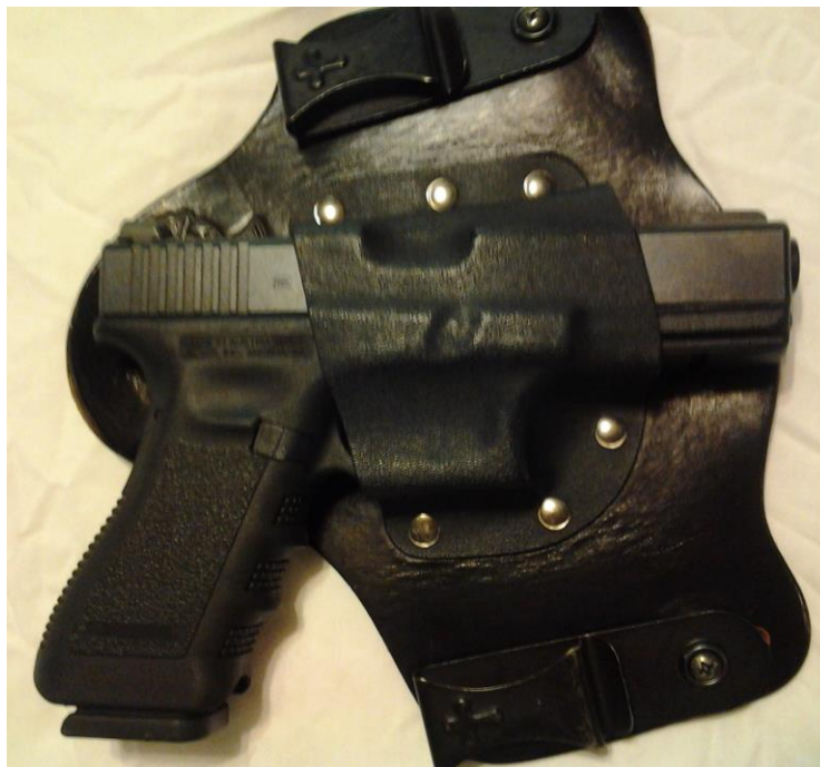
A Glock 31 with the light rail inside the holster